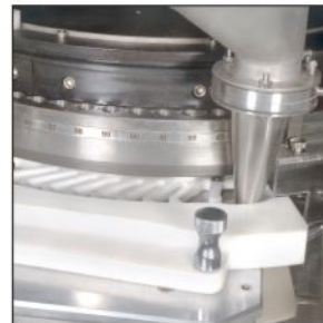
Multi Chamber Feeder